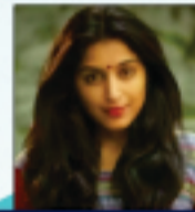
Ms. Padmapriya Janakiraman Actor & Dancer Batch - 2000-2002