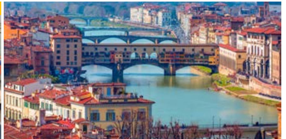
Festylund, Caen, France