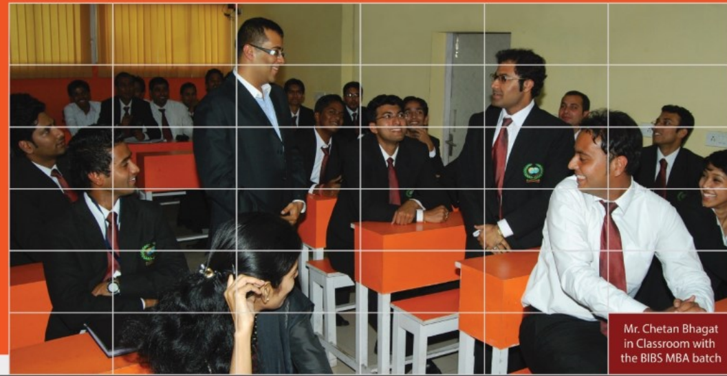
Mr. Chetan Bhagat in Classroom with the BIBS MBA batch