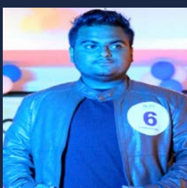
Vivek Dev Pin Click Properties